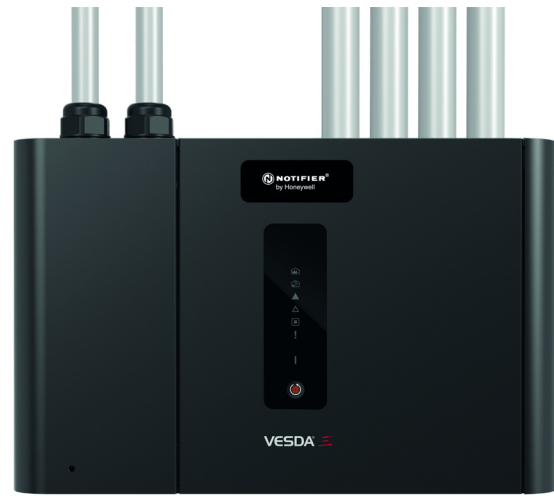
Intelligent VESDA-E VEP-A10-P-NTF

The Intelligent VESDA-E VEP Series is compatible with existing VESDA installations. The detector occupies the same mounting footprint, pipe, conduit and electrical connector positioning as VESDA VLP.